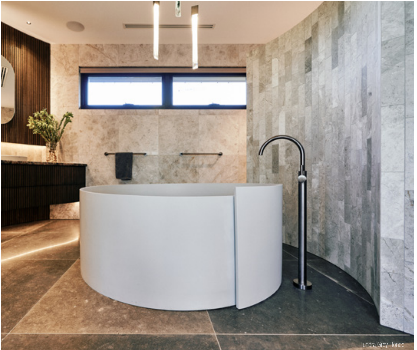
Tundra Grey Honed