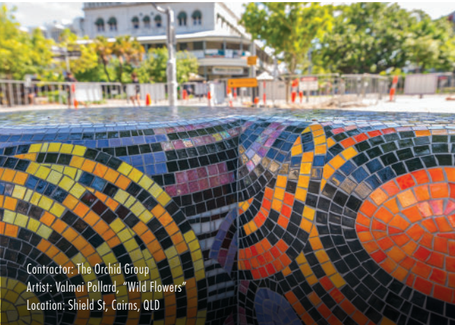
Contractor: The Orchid Group Artist: Valmai Pollard, "Wild Flowers" Location: Shield St, Cairns, QLD